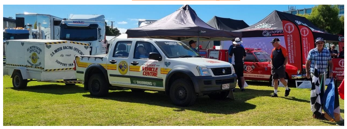
Thank you to these businesses who have supported SAMROA in various ways recently