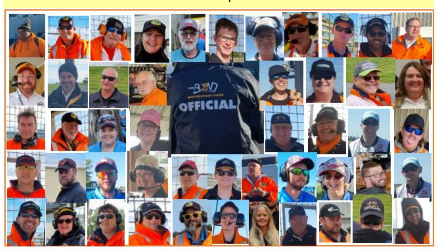
SAMROA is proudly supported by

Wed. 8th February 2023, at The Maid Hotel, 1 Magill Road, Stepney starting at 7:30pm