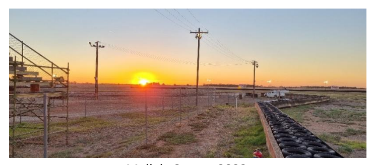
Mallala Sunset 2022

Events Calendar: <a href="https://motorsport.org.au/events/championships/state/sa-nt">https://motorsport.org.au/events/championships/state/sa-nt</a> (this site is not validated for accuracy by SAMROA)