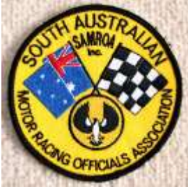
SAMROA Sew On Badge - $6