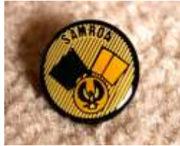
SAMROA Cross Flags (Metal) - $3