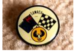
SAMROA Logo Pin (Metal) - $3