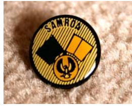
SAMROA Cross Flags (Metal) - $3