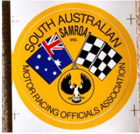
SAMROA Sticker - $3 (10cm across)