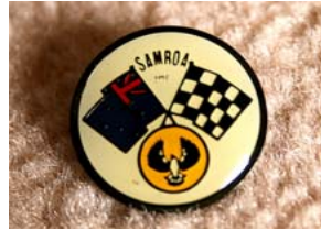
SAMROA Logo Pin (Metal) - $3