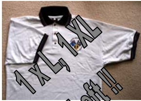
SAMROA T-shirt - $40