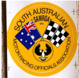
SAMROA Sticker - $3 (10cm across)