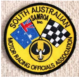
SAMROA Sew On Badge - $6