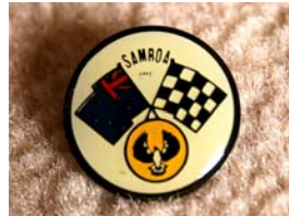
SAMROA Logo Pin (Metal) - $3