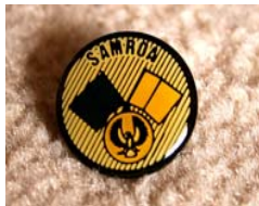
SAMROA Cross Flags (Metal) - $3