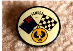
SAMROA Logo Pin (Metal) - $3