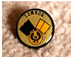
SAMROA Cross Flags (Metal) - $3