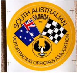
SAMROA Sticker - $3 (10cm across)