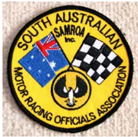
SAMROA Sew On Badge - $6