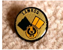
SAMROA Cross Flags (Metal) - $3