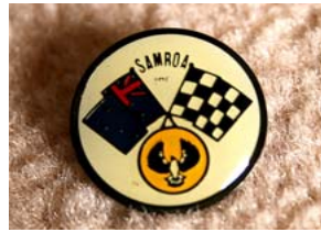
SAMROA Logo Pin (Metal) - $3