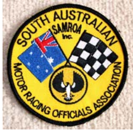
SAMROA Sew On Badge - $6