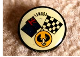
SAMROA Logo Pin (Metal) - $3