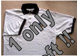
SAMROA Polo - $40