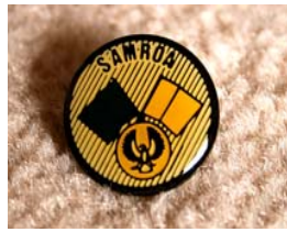
SAMROA Cross Flags (Metal) - $3