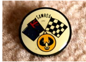
SAMROA Logo Pin (Metal) - $3