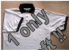
SAMROA Polo - $40