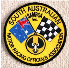
SAMROA Sew On Badge - $6