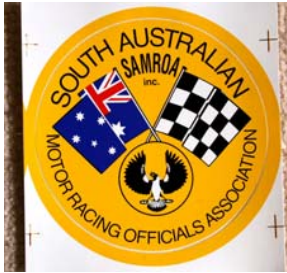
SAMROA Sticker - $3 (10cm across)