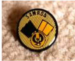
SAMROA Cross Flags (Metal) - $3