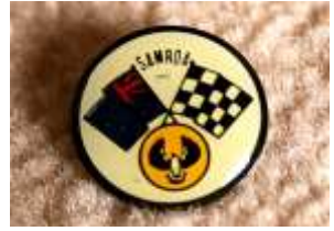
SAMROA Logo Pin (Metal) - $3