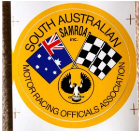
SAMROA Sticker - $3 (10cm across)