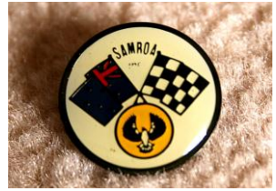
SAMROA Logo Pin (Metal) - $3