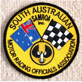
SAMROA Sew On Badge - $6