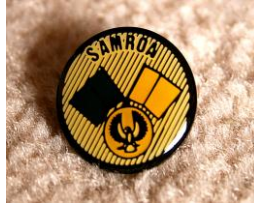
SAMROA Cross Flags (Metal) - $3