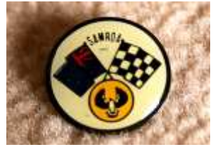
SAMROA Logo Pin (Metal) - $3