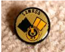
SAMROA Cross Flags (Metal) - $3