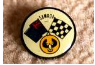
SAMROA Logo Pin (Metal) - $3