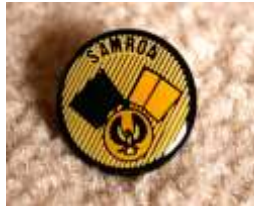
SAMROA Cross Flags (Metal) - $3