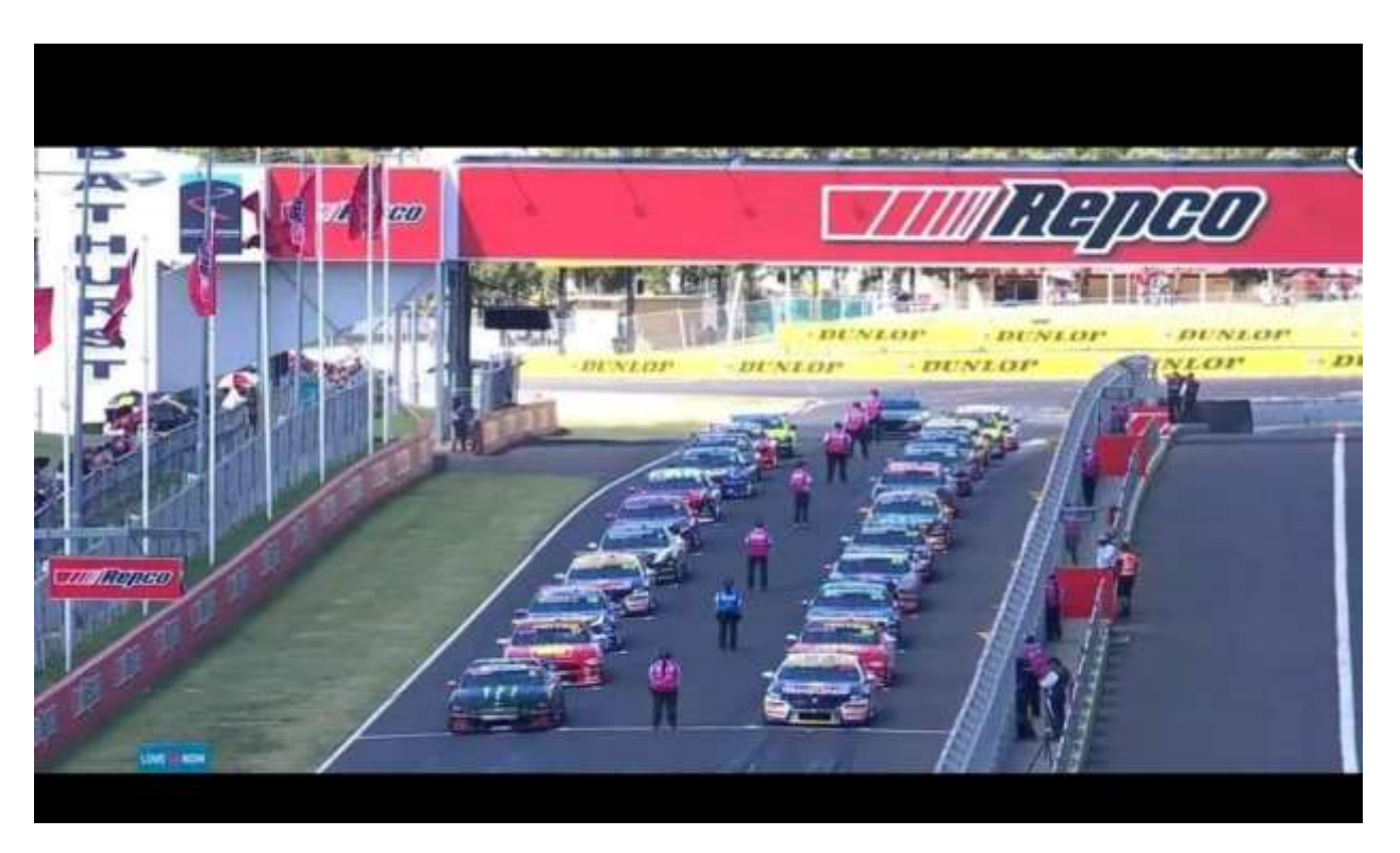
SAMROA is proudly supported by

Due to COVID-19 requirements, on entry you must scan the QR code or complete the manual registration.