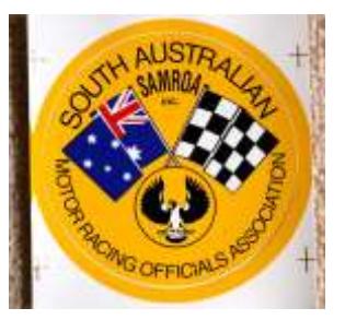
SAMROA Sticker - $3 (10cm across)