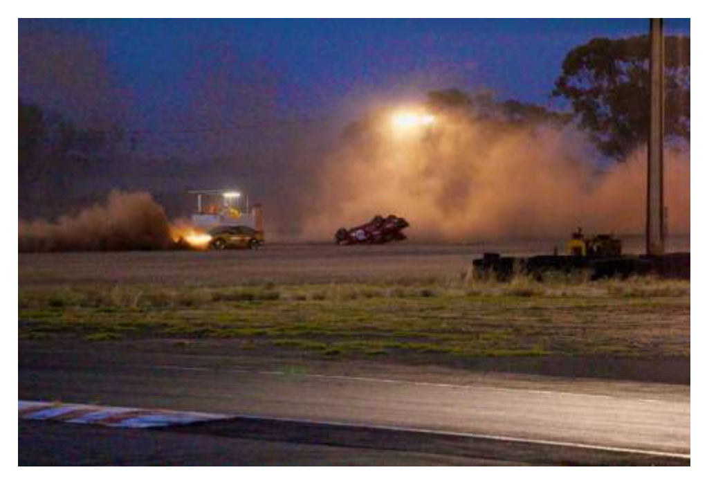
Congratulations on a job well done SAMROA