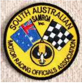
SAMROA Badge - $6