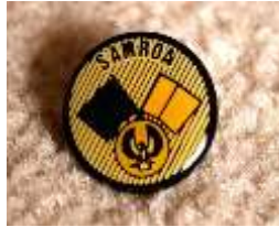
SAMROA Cross Flags (Metal) - $3