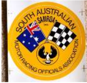
SAMROA Sticker - $3 (10cm across)