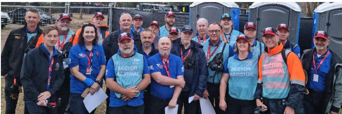
2023 Sector Marshall team

Wishing everyone a fabulous new year for 2024.