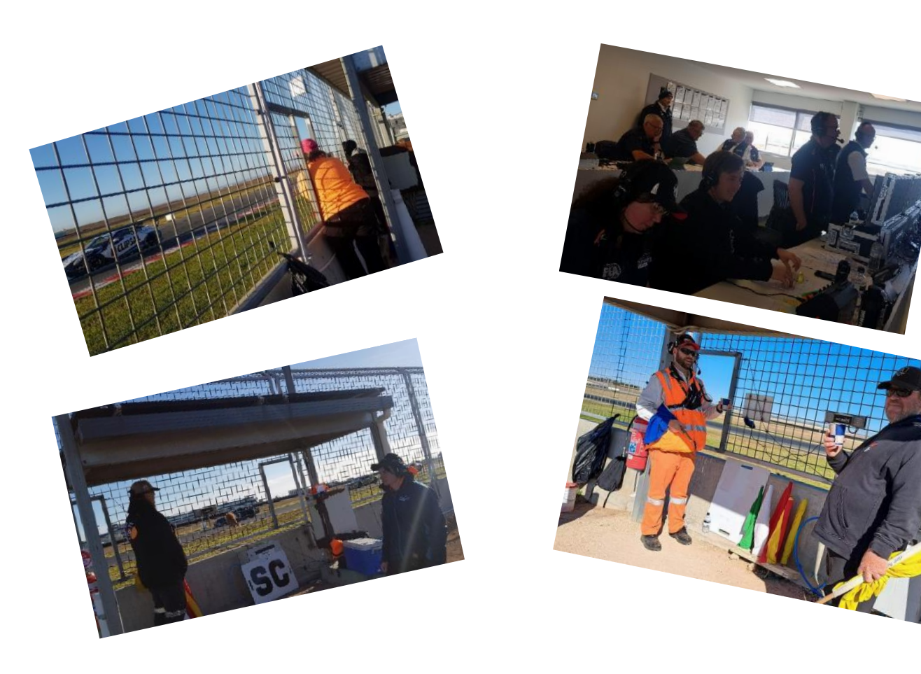
2024 SA Motor Racing Calender