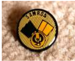
SAMROA Cross Flags (Metal) - $3