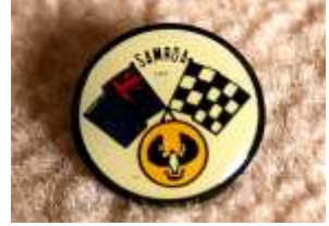
SAMROA Logo Pin (Metal) - $3