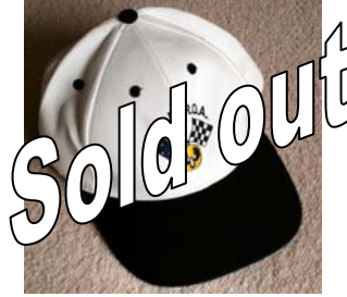
SAMROA Cap - $10