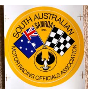
SAMROA Sticker - $3