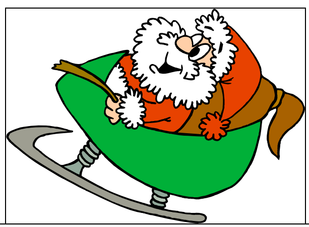
SAMROA wishes all members and their families a happy, peaceful and safe holiday period.