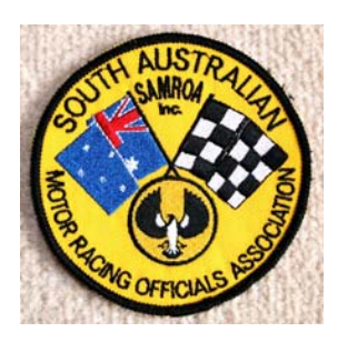
SAMROA Sew On Badge - $6