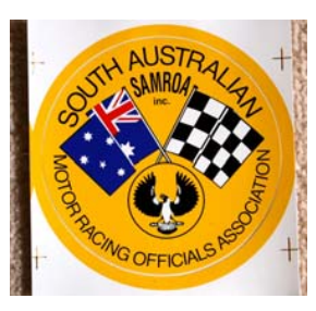
SAMROA Sticker - $3 (10cm across)