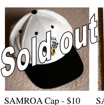
(Hurry – only 2 left!)