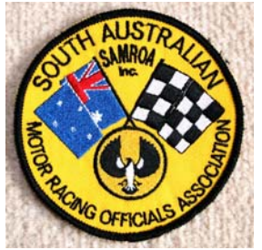
SAMROA Sew On