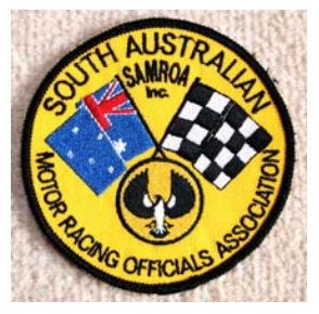
SAMROA Sew On Badge - $6