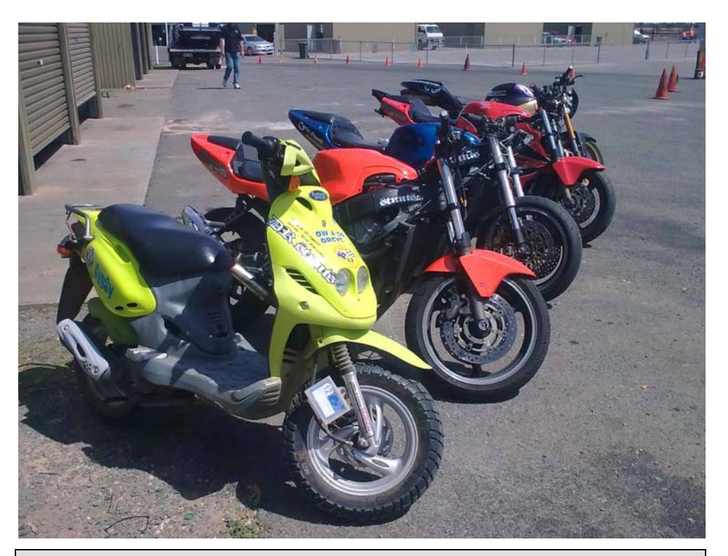
Odd Spot: Did the scooter get upgraded? Will we see Chief flag on 1 wheel? (Again?) These answers and more at the next Superkart/Modern Regularity meet on Dec 6^{th} ....