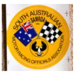
SAMROA Sticker - $3 (10cm across)