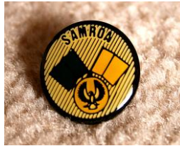
SAMROA Cross Flags (Metal) - $3