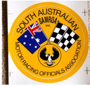
SAMROA Sticker - $3 (10cm across)