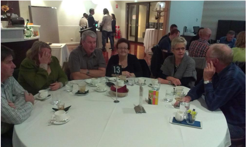
Diner at Tiro's

ROYAL HOTEL, 02 North Terrace, Kent Town, SA, 5067