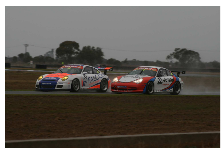
Action from Shannons