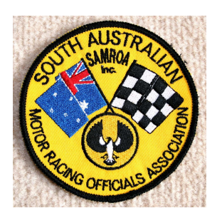
SAMROA Sew On Badge - $6