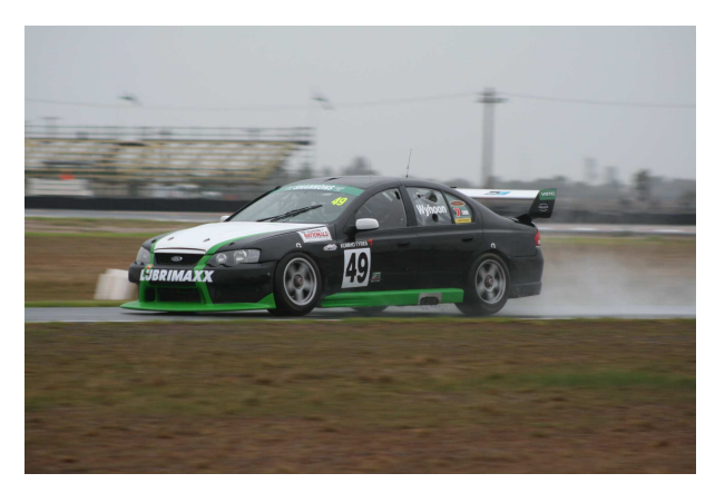
Further Shannons action