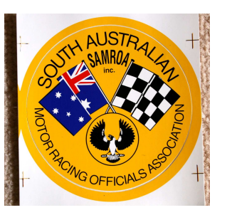
SAMROA Sticker - $3 (10cm across)