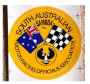
SAMROA Sticker - $3 (10cm across)