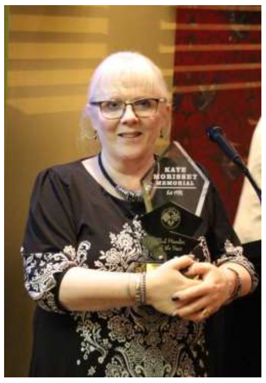
SAMROA proudly supported by