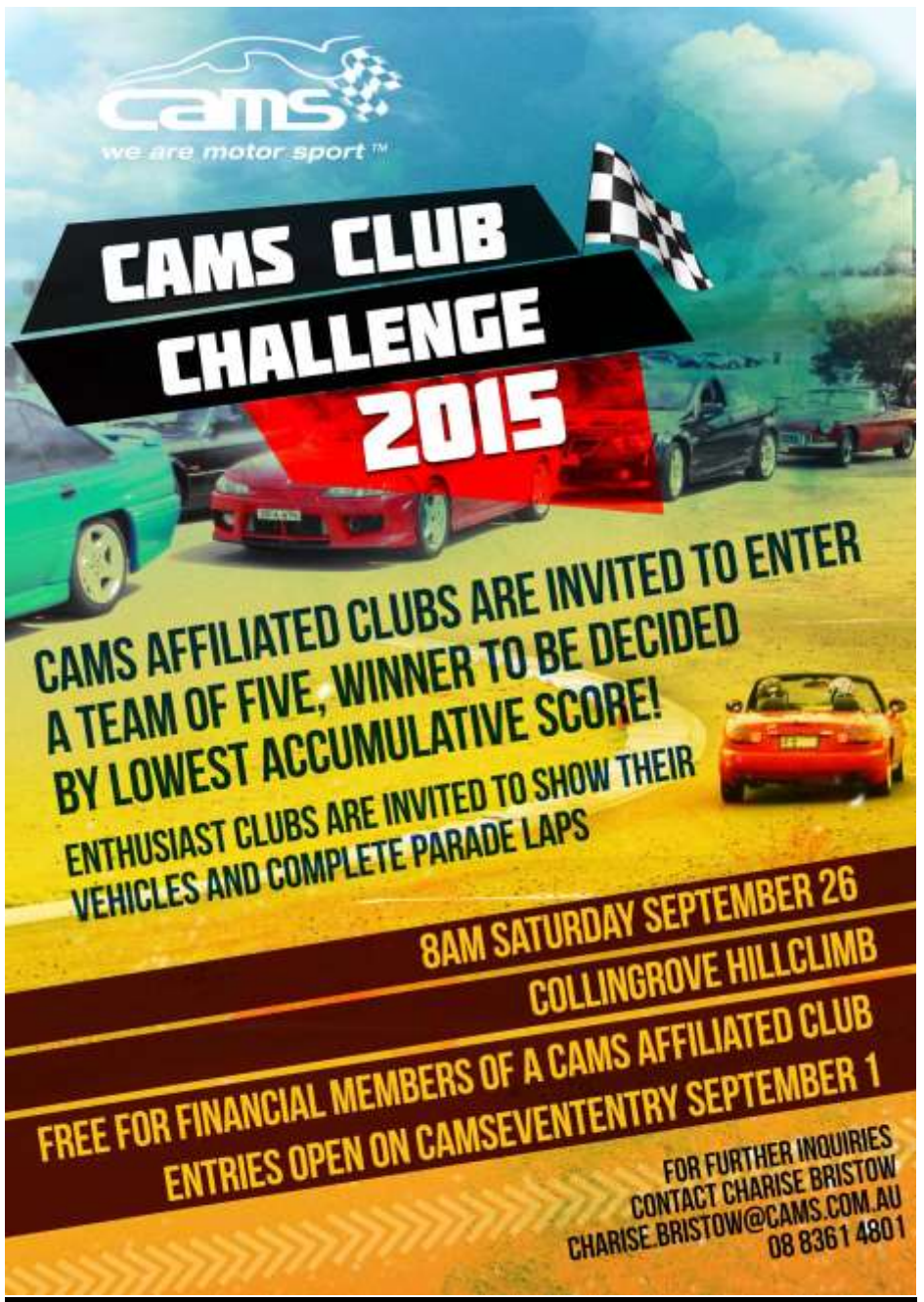
Yes, SAMROA is participating, come along and join the fun...