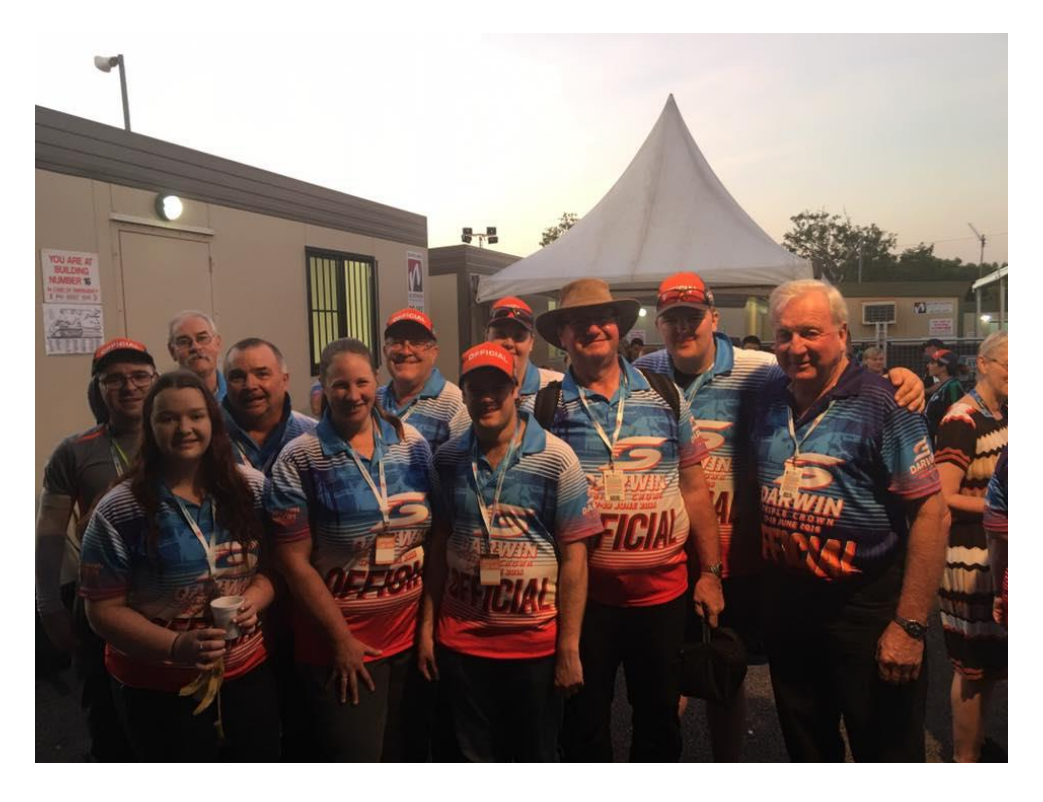
SAMROA proudly supported by