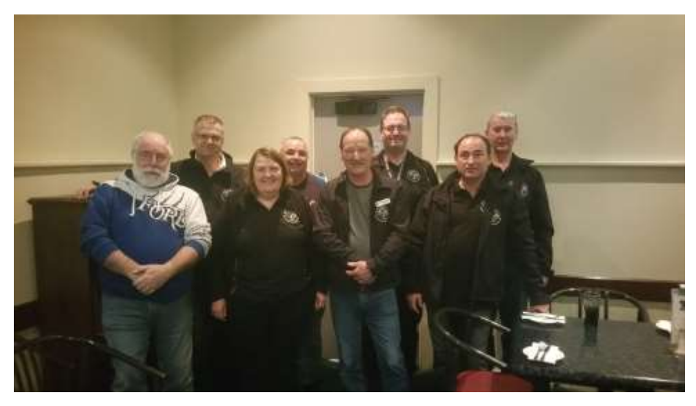
SAMROA is proudly supported by