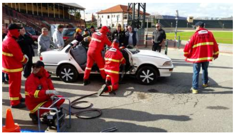
SAMROA is proudly supported by