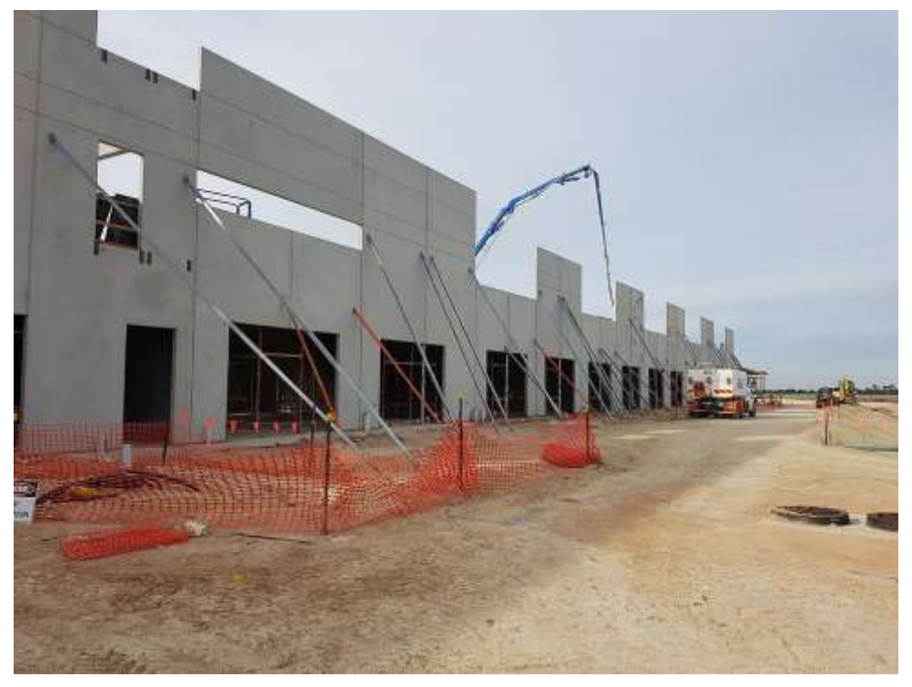
SAMROA is proudly supported by