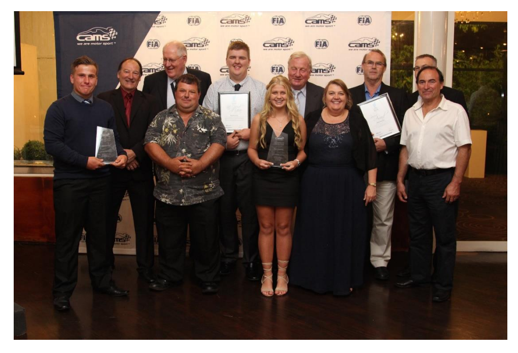
SAMROA is proudly supported by