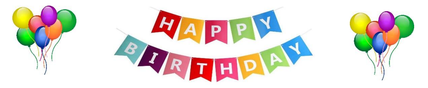
Happy birthday to our members who have already celebrated or will be celebrating milestones in October.