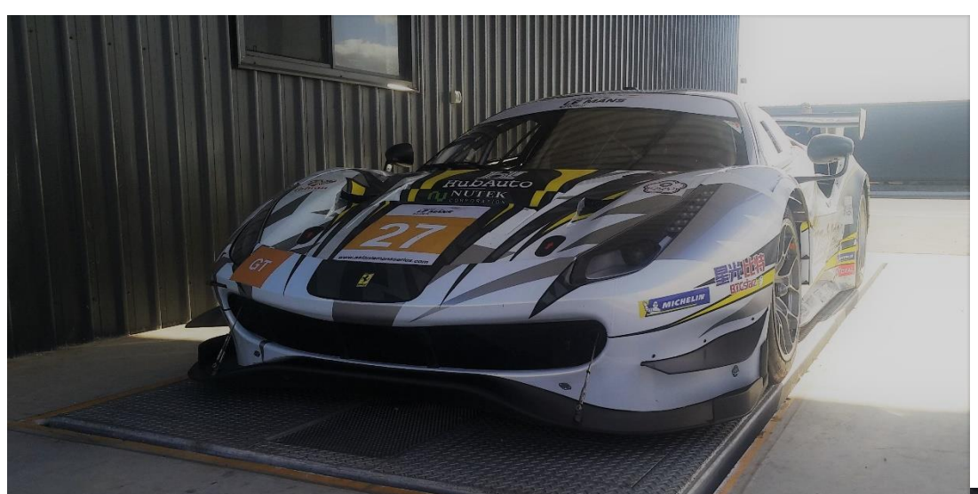
Figure 3 - HubAuto Corsa Ferrari 488 GT3 at The Bend, Asian Le Mans 2020