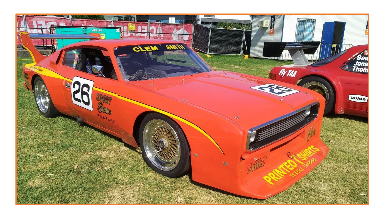
SAMROA is proudly supported by

Due to COVID-19 meetings are suspended until further notice. Please keep an eye on your emails, social media and the newsletters for updates.