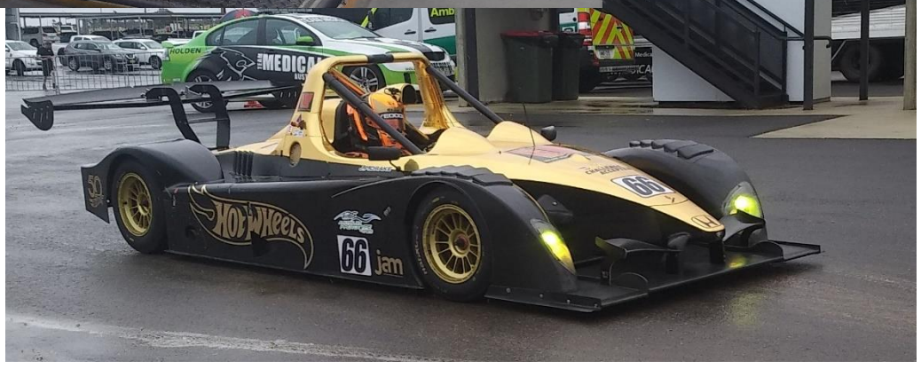
Figure 4 - JP Drake's Radical at The Bend, Asian Le Mans 2020