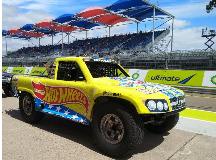
Figure 1 - Matt Mingay Stadium Super Truck 2020 Superloop Adelaide 500