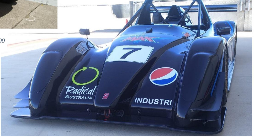
Figure 2 – Yasser Shahin's Radical at The Bend, Asian Le Mans 2020.