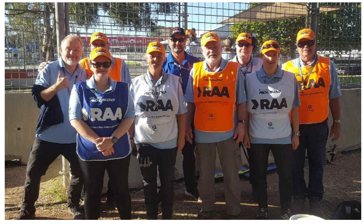
Superloop Adelaide 500 2020