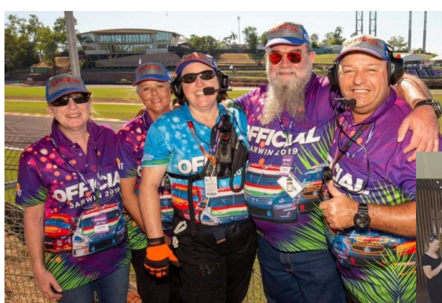
Hidden Valley 2019